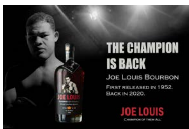
JOE LOUIS BOURBON